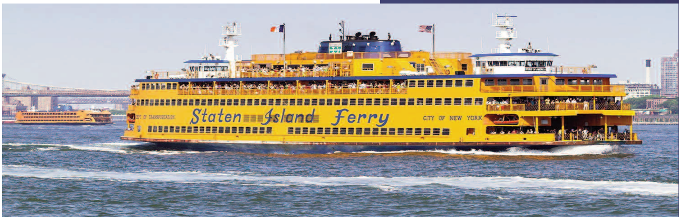
New York City Staten Island Ferry, Spirit of America, equipped with Thordon Water Quality Package and COMPAC seawater lubricated propeller shaft bearings.